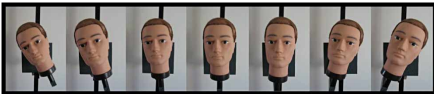
Figure 1. The plastic head in seven orientations. From left to right, the 25^\circ , 15^\circ , and 5^\circ to the left, the 0^\circ or neutral, and the 5^\circ , 15^\circ , and 25^\circ to the right orientations. [To see a colour version of the Figure, please visit the online version of the journal.]

Each kiss was first categorised as either a kiss to the right or a kiss to the left. A kiss to the right was defined as (i) a rightward lateral flexion of the head at